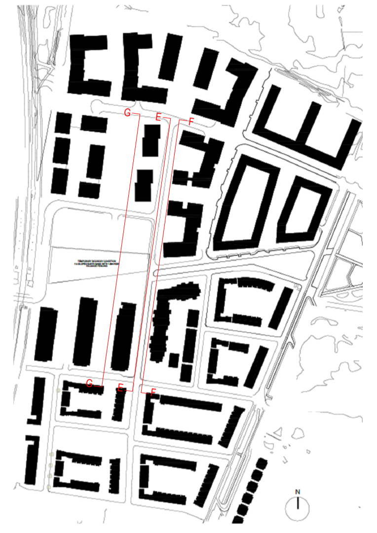
1 Elevation/ Section EE 1 : 500

AS PERMITTED FCC Reg. Ref. F16A/0412, ABP Reg. Ref. ABP-248970 (and as amended under F20A/0258 and F21A/0046)